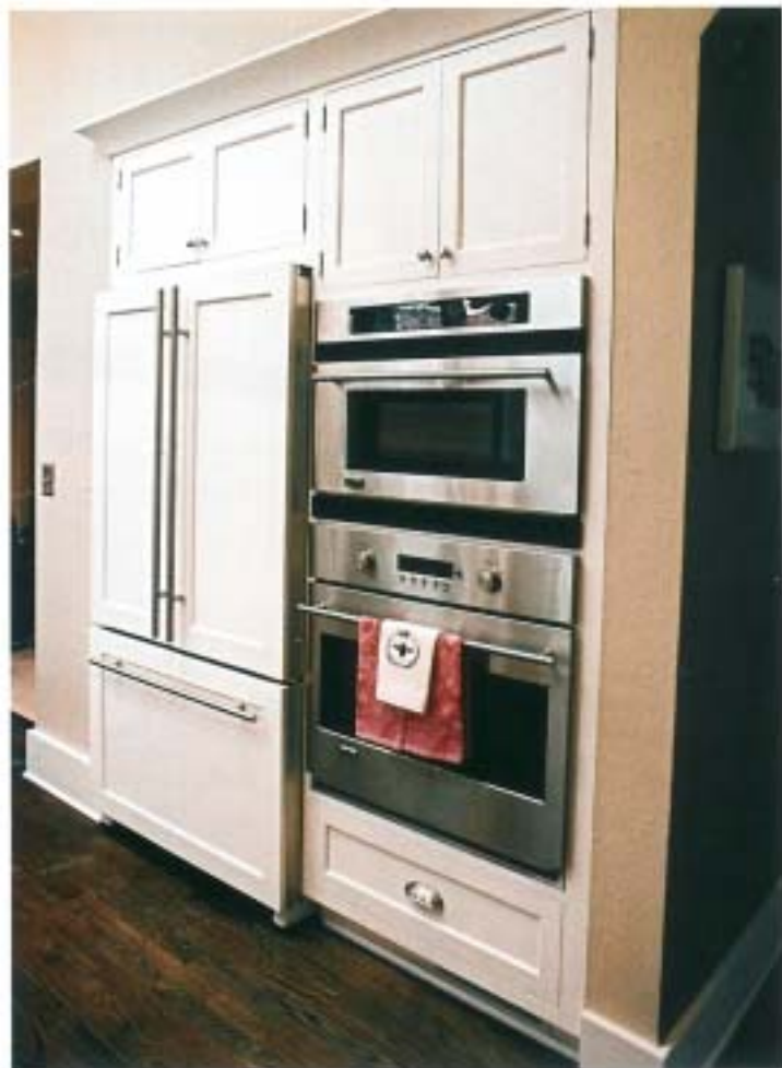
More storage and brighter space helped make this project successful.