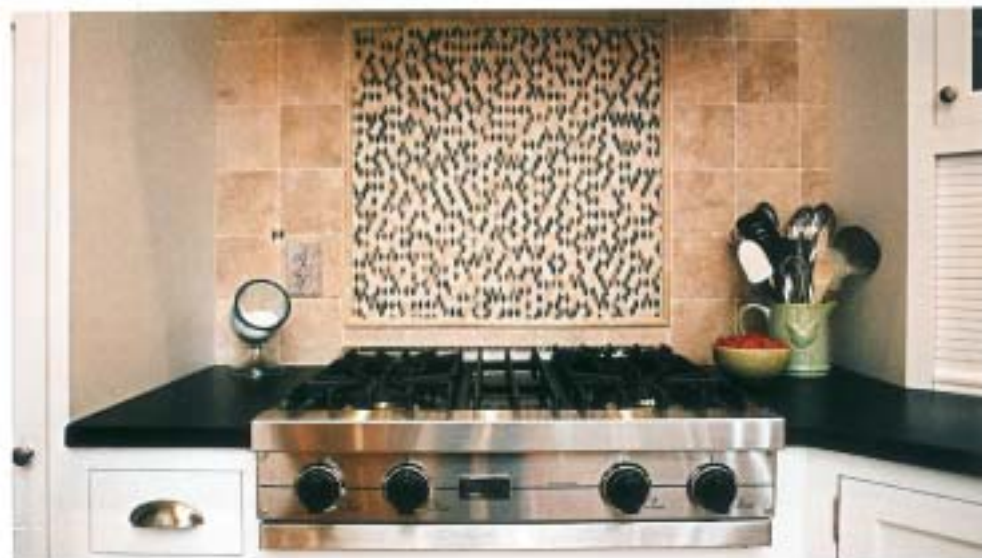
Tile work behind the Viking stove creates a focal point.

installing the right window treatments. The shades can be raised or lowered to cover views while allowing sunlight.